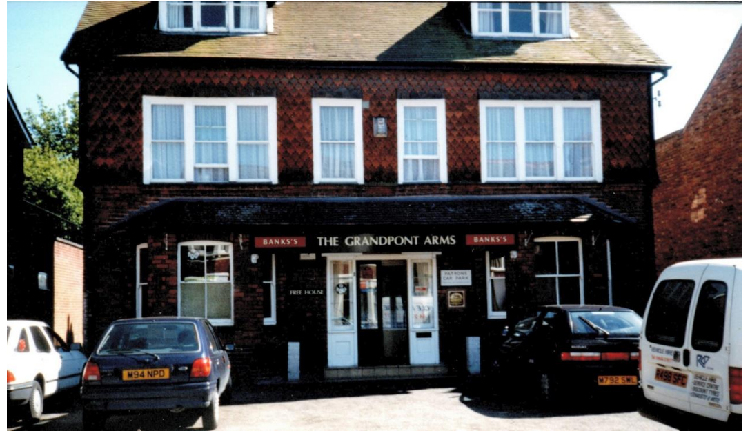
(Left) plans of the Grandpont Arms, Edith Road, and (above) the pub in the 1990s.